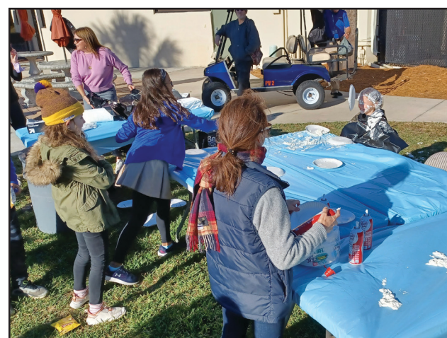
Snowballs weren't the only things to throw. At this table, students tossed whipped-cream "pies" at fearless classmates.