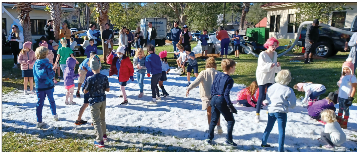
Crushed ice was sprayed onto the play area behind the Bolles Lower School Ponte Vedra Beach buildings to create a field of snow for the students to play in.

The campus was adorned with festive wintry decorations, but none outshone the many smiles on students' faces.