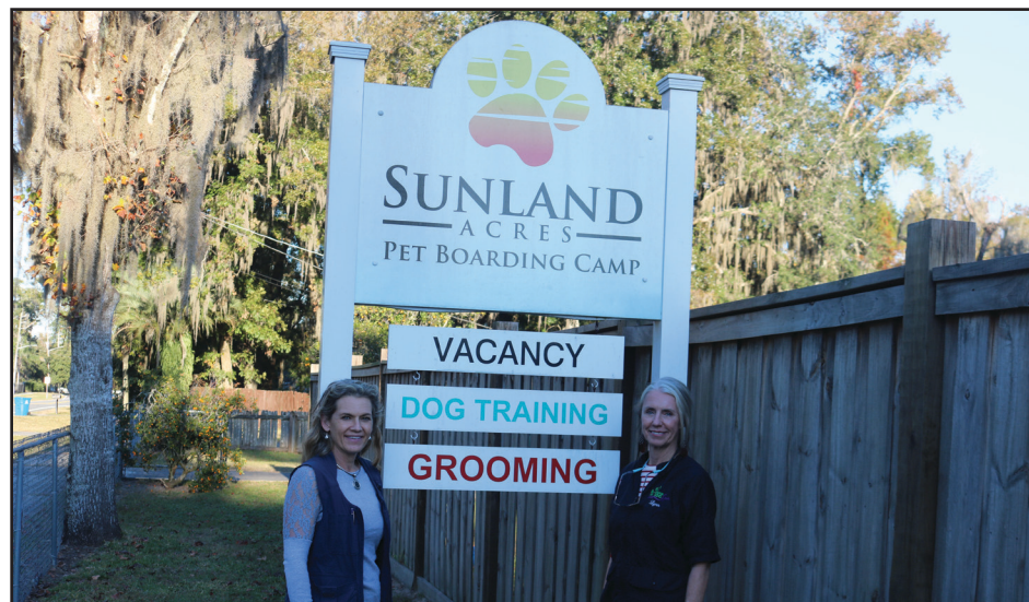
Sunland Acres Pet Boarding offers grooming and dog training as part of its list of available services.