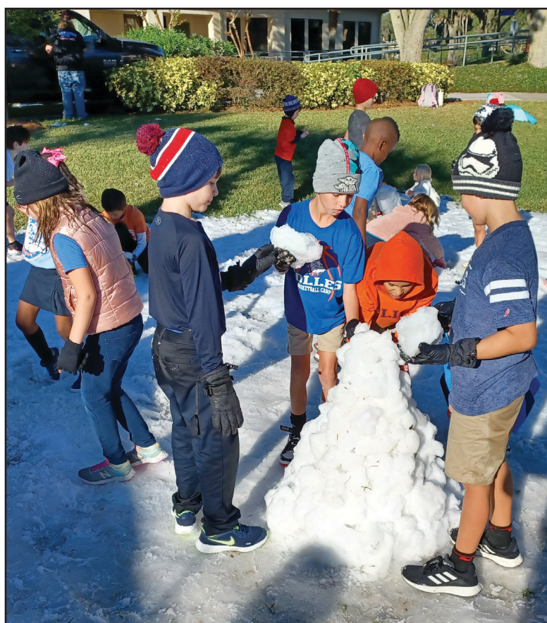
Bolles Lower School Ponte Vedra Beach students build a snowman during Winter Fest.