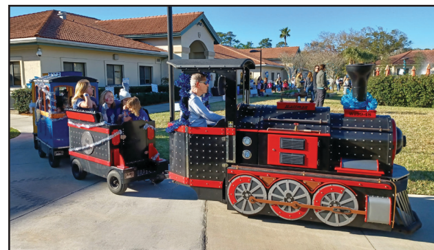
The Winter Fest train was very popular among the students.